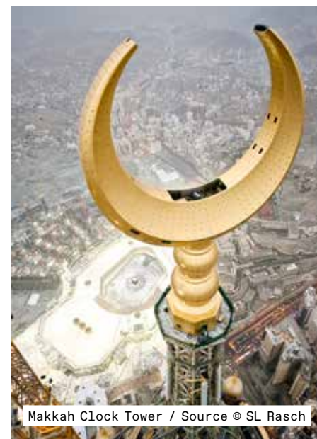
Makkah Clock Tower