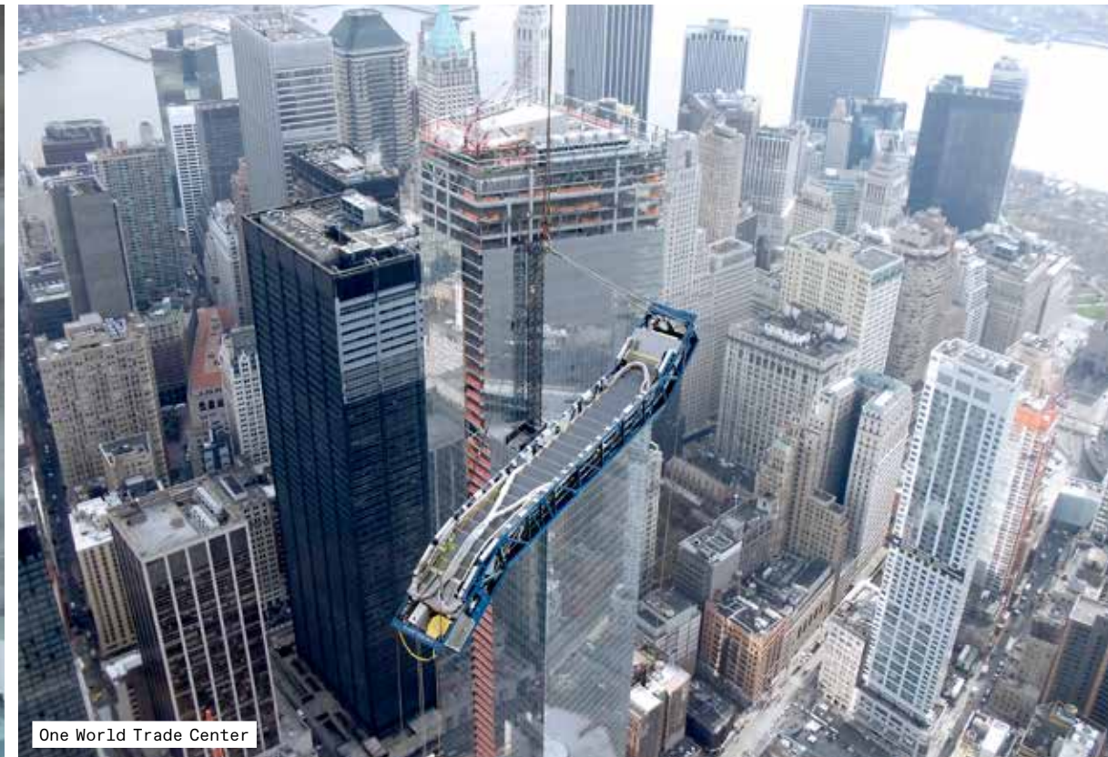
One World Trade Center